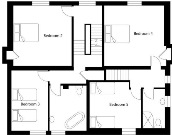
First Floor - Approx 106 SQ M