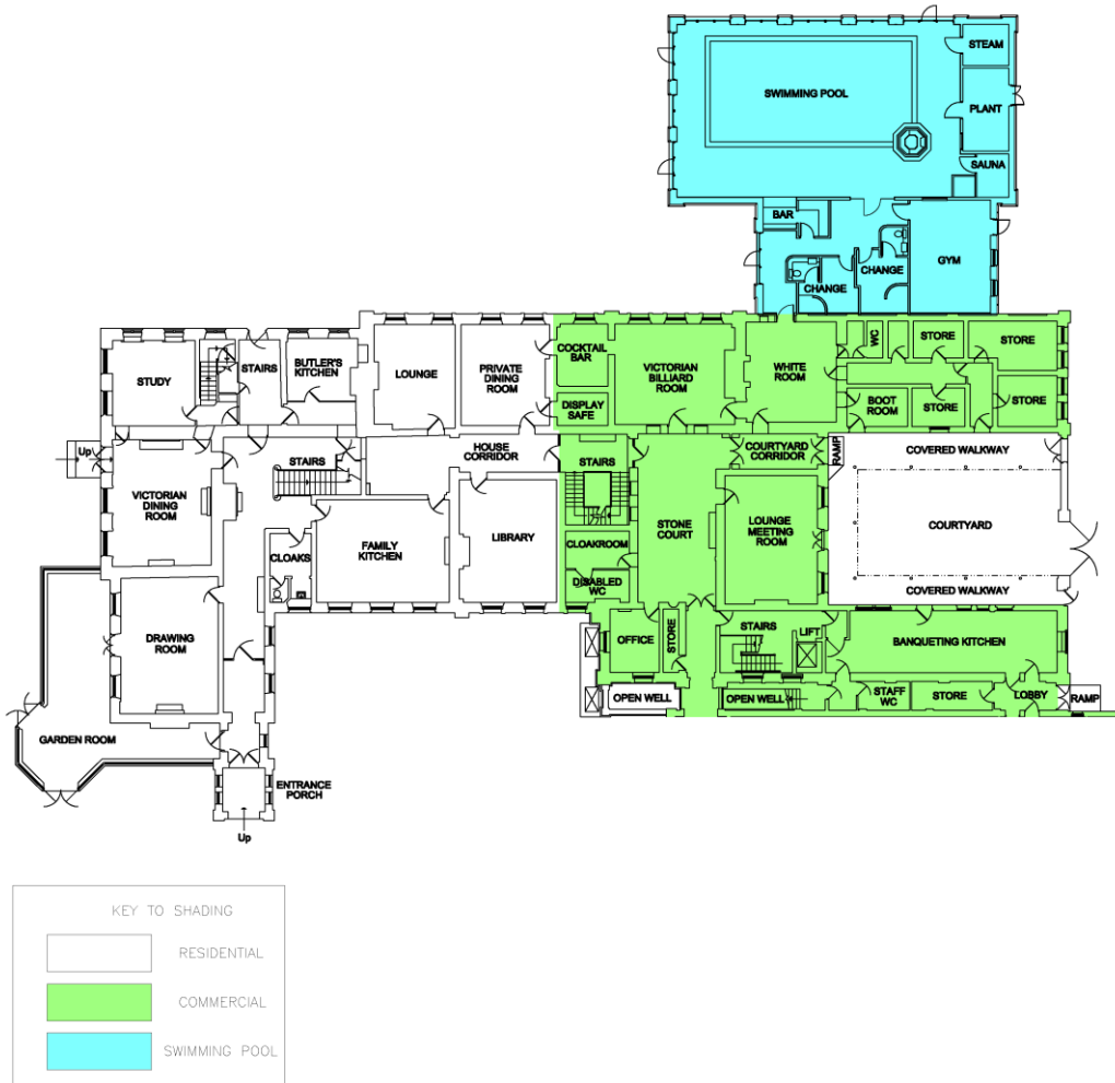
Stancliffe Hall, Whitworth Road, Darley Dale Existing Layout - Ground Floor Plan